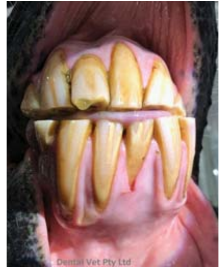
Above: Abnormal appearing incisors in a horse with EOTRH

1. Hole, S. and Staszuk, C. (2016). Equine odontoclastic tooth resorption and hypercementosis. Equine Veterinary Education, 30(7), pp.386-391