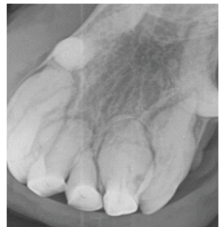
Below: X-ray findings in a horse with EOTRH, including osteoclastic lesions (a) and hypercementosis (b)